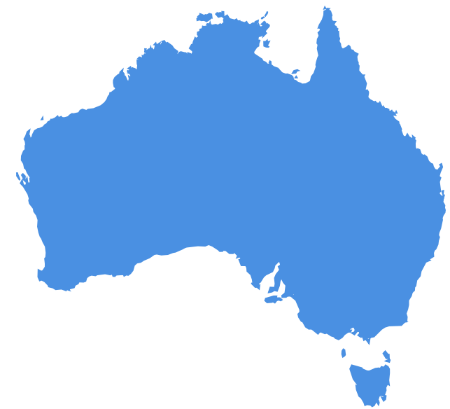
Australian Research Council Impact Studies