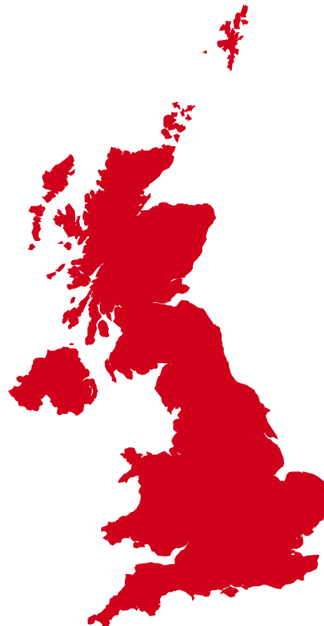
REF Case Studies