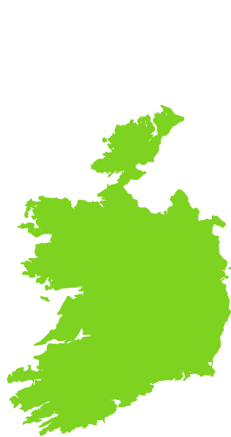
UCD Case Studies